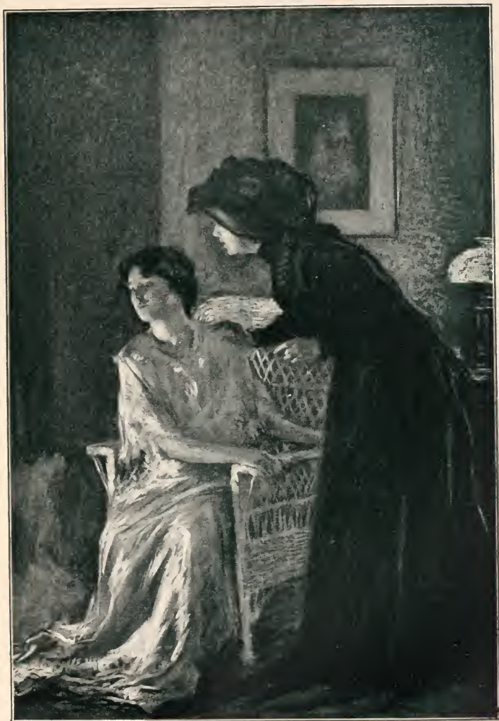
CLUTCHING HER SHOULDER, SHE LOOKED HARD INTO THE YOUNGER WOMAN'S FACE